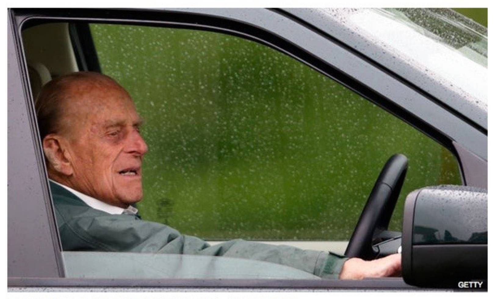
Prince Philip has a chat out his landrover window - but is still alone

"It's an unenviable task being a CPO to someone of that stature."